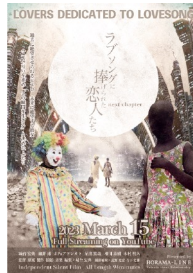
LDTLS next chapter Free viewing