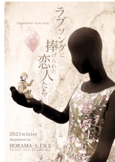
Lovers Dedicated to Love Song Free viewing